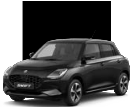
Super Black Pearl