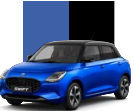
Frontier Blue/Super Black