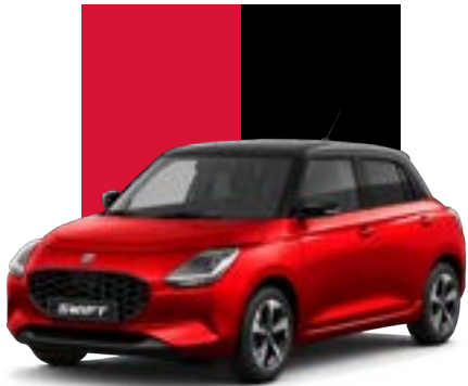
Burning Red/Super Black