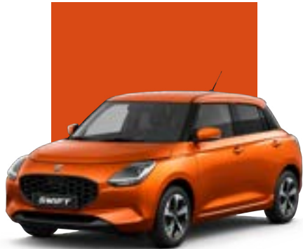
Flame Orange Pearl Metallic