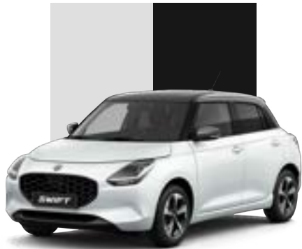
Pure White/Mineral Grey