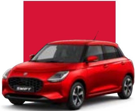
Burning Red Pearl Metallic