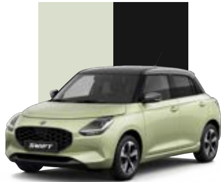
Cool Yellow/Mineral Grey