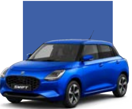
Frontier Blue Pearl Metallic