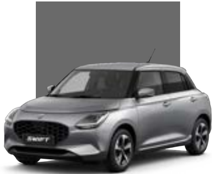
Premium Silver Metallic