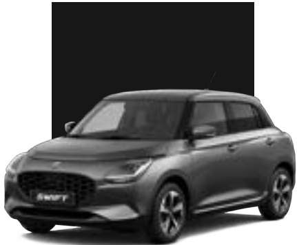
Mineral Grey Metallic