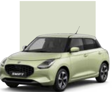
Cool Yellow Metallic