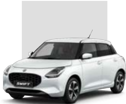
Pure White Pearl