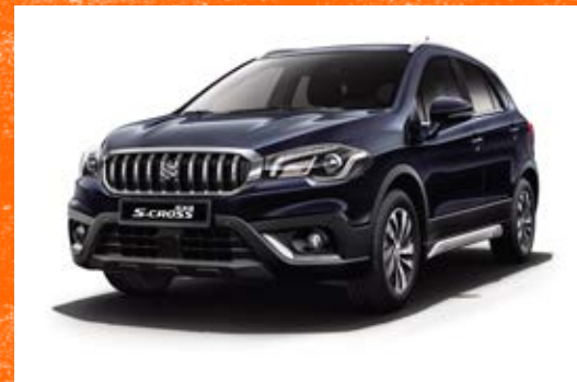
Sphere Blue Pearl Metallic