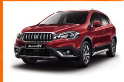
Energetic Red Pearl Metallic