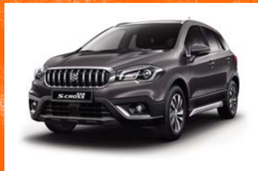
Mineral Grey Metallic