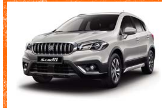
Silky Silver Metallic