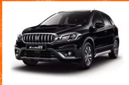
Cosmic Black Pearl Metallic