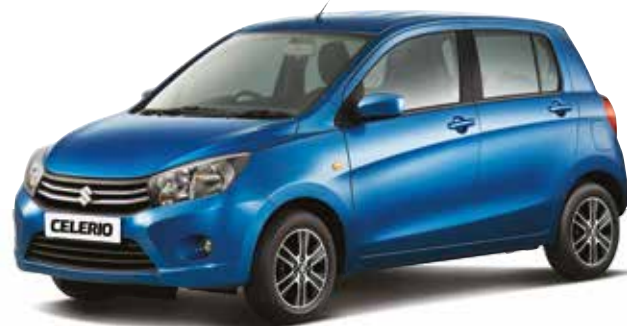
CERULEAN BLUE PEARL METALLIC