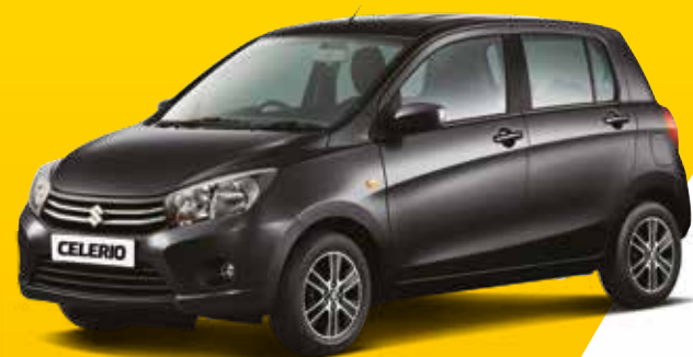
SUPER BLACK PEARL METALLIC

The Celerio comes in a range of striking colours, so you can express yourself with some street style.