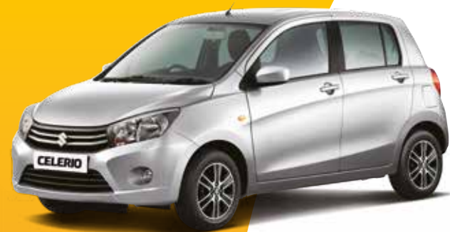
STAR SILVER METALLIC