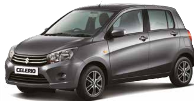
MINERAL GREY METALLIC