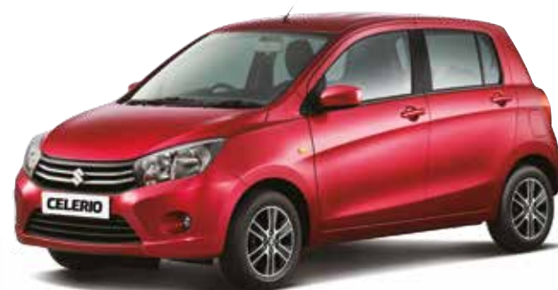
ABLAZE RED PEARL METALLIC