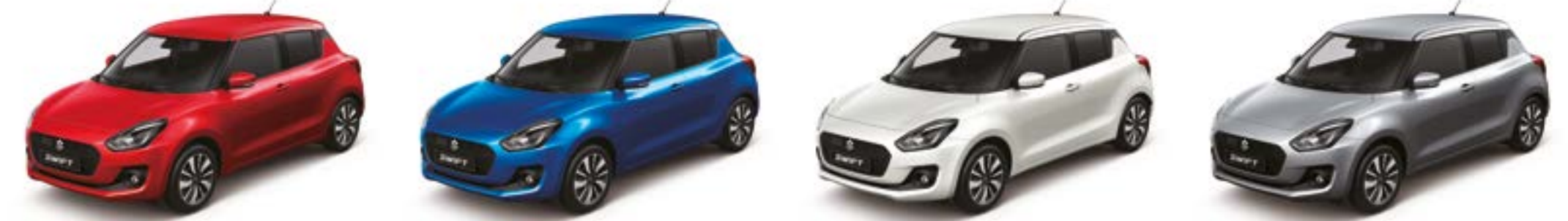
Burning Red Pearl Metallic Speedy Blue Metallic Pure White Pearl Premium Silver Metallic