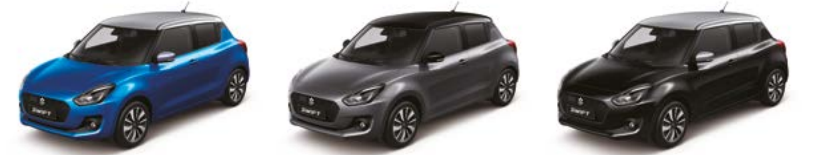
Speedy Blue/Premium Silver Mineral Grey/Super Black Super Black/Premium Silver