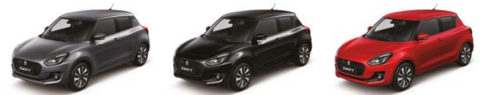
Mineral Grey Metallic Super Black Pearl Fervent Red