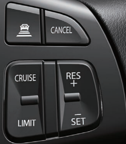
Adaptive cruise control*