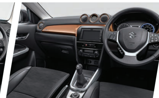
Orange instrument panel and vent surrounds

As standard on Horizon Orange/Cosmic Black exterior colour option.