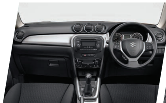
Silver instrument panel