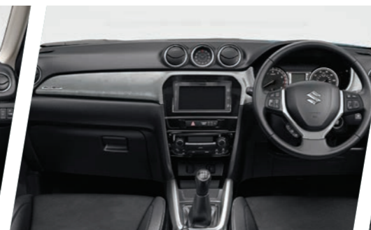
Chequered instrument panel