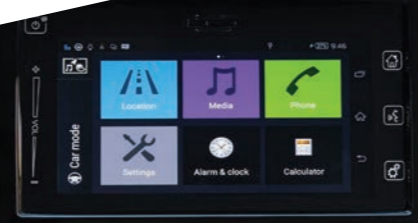
Smartphone link audio*