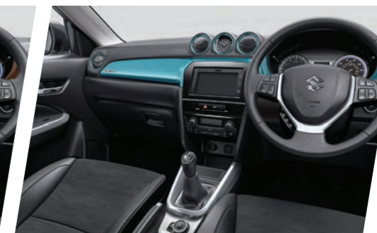
Turquoise instrument panel and vent surrounds

As standard on Atlantis Turquoise/Cosmic Black exterior colour option.