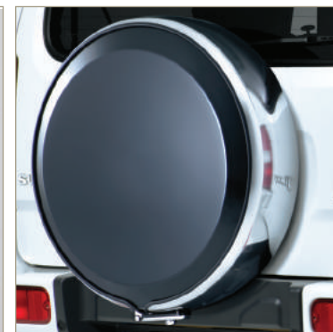
HARD SPARE WHEEL COVER