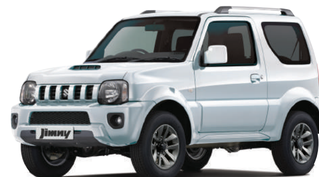
PEARL WHITE METALLIC†