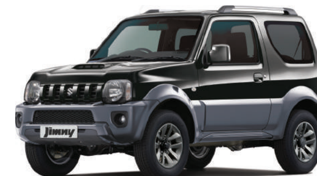
BLUEISH BLACK PEARL METALLIC/ QUASAR GREY 2-TONE†