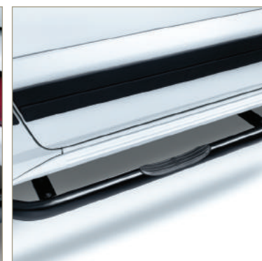
SIDE SPORT BAR SET (BLACK)