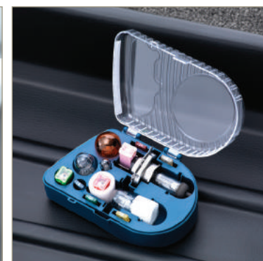
SPARE BULB AND FUSE SET