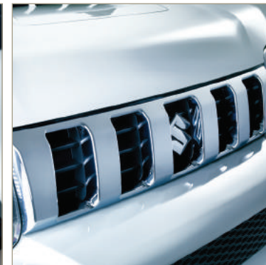
CHROMED FRONT GRILLE TRIM