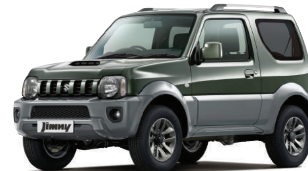
KHAKI GREEN METALLIC/ QUASAR GREY 2-TONE†