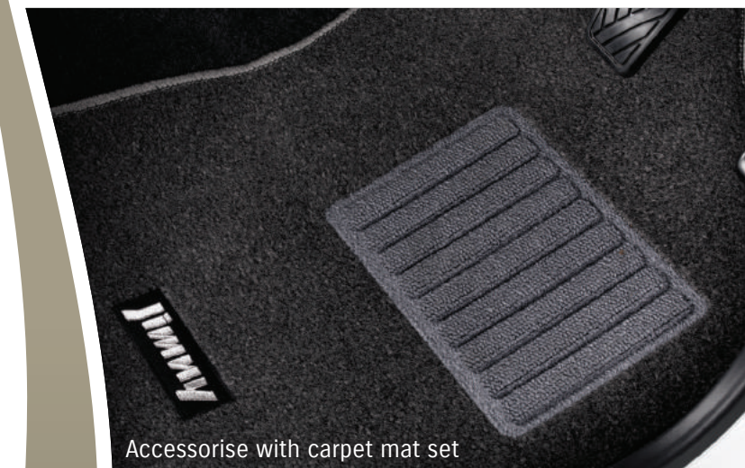
Accessorise with carpet mat set