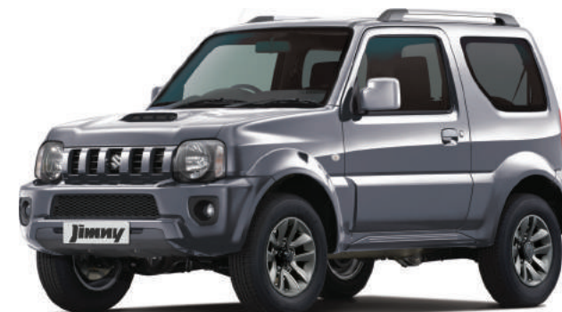
QUASAR GREY METALLIC*†