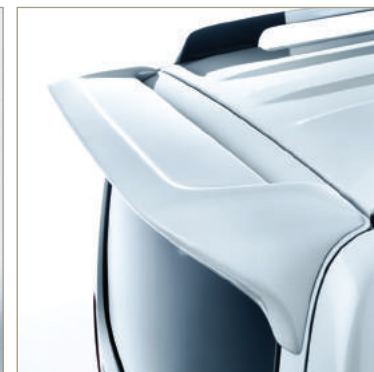
REAR UPPER SPOILER