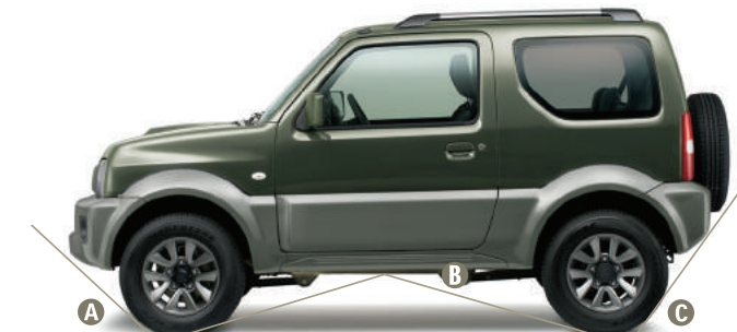
A 34° approach angle (default setting, unloaded Jimny) B 31° ramp breakover angle C 46° departure angle

All year round, the Jimny is a 4x4 designed for adventure. Every time you climb aboard, there's one waiting to happen.