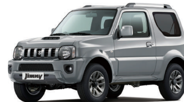
STEEL SILVER METALLIC†