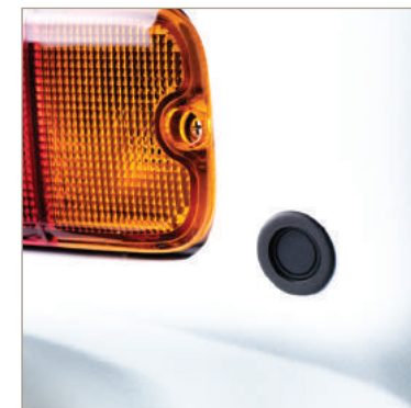
REVERSING AID SENSOR SET