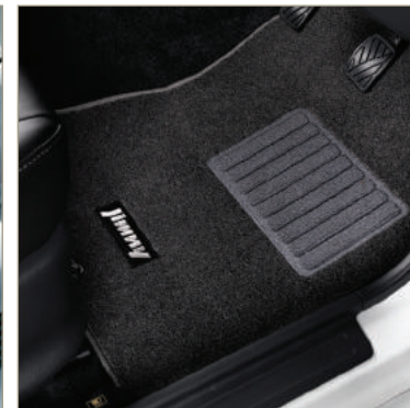
CARPET MAT SET