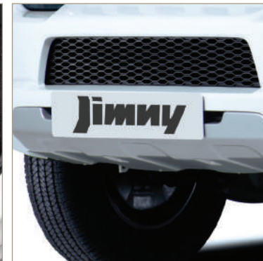
FRONT SKID PLATE