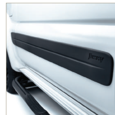
SIDE MOULDING SET