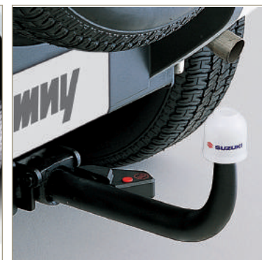
DETACHABLE TOW-BAR ASSEMBLY