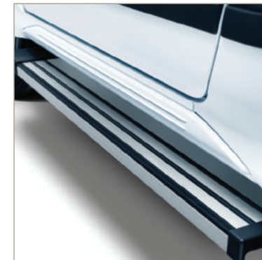
ALUMINIUM RUNNING BOARD

Whether you're down the high street or up a mountain, the Jimny has the versatility to cope. And its range of good-looking, hard-working accessories only makes it better. You'll find all of them on our website. So for once, we're going to suggest you let your fingers do the walking to: suzuki.co.uk/cars/accessories