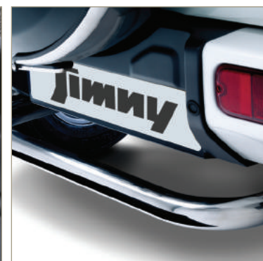
CHROMED REAR SPORT BAR