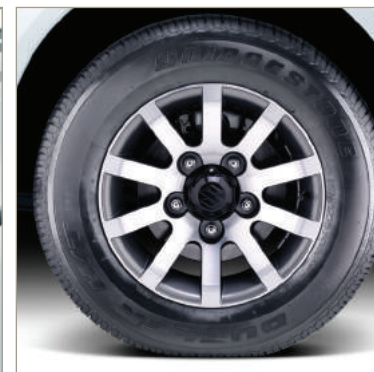
'DAKAR' ALLOY WHEEL