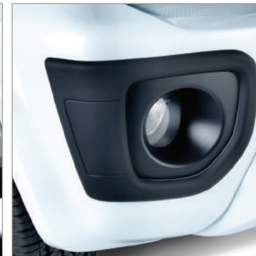
BUMPER CORNER PROTECTOR SET