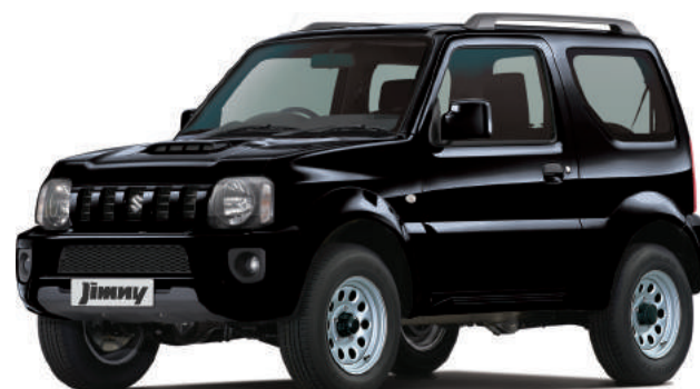
BLUEISH BLACK PEARL METALLIC*